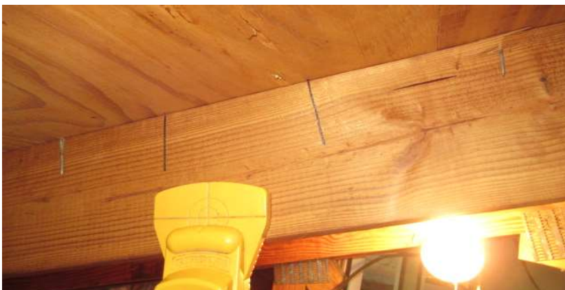
Nail location verified