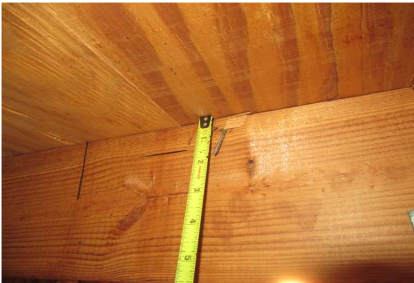
8d nails verified