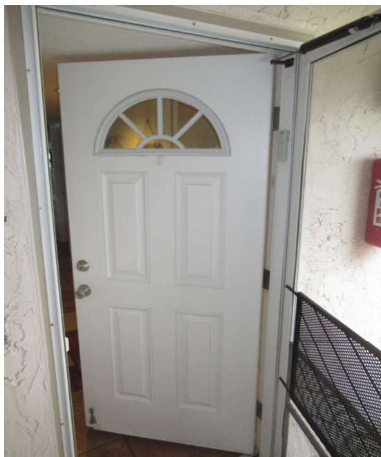
Front doors of all units in the building meet the impact standard