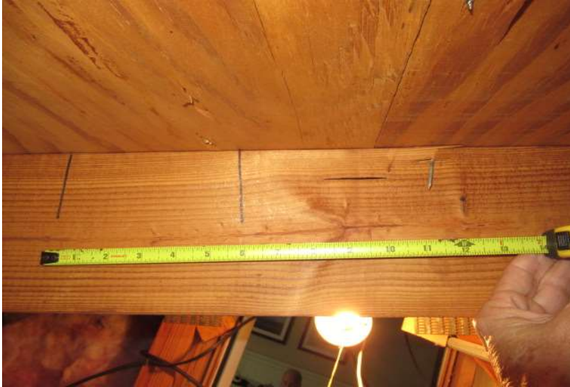
6" spacing in the field