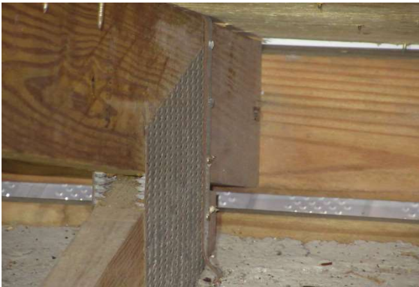
Single strap with at least 3 nails into the truss